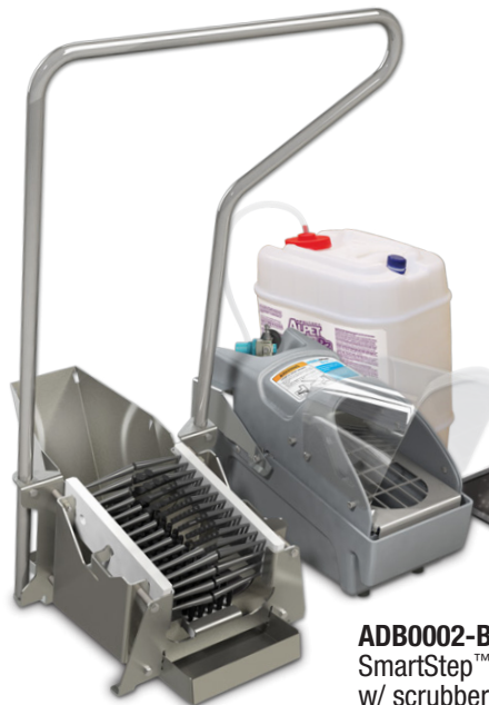
ADB0002-BS SmartStep TM Sanitizing Unit w/ scrubber and handle

Adding a floor mat with one of our Dry Step Floor Treatments provides a sure-footed surface for exiting the sanitizing unit.