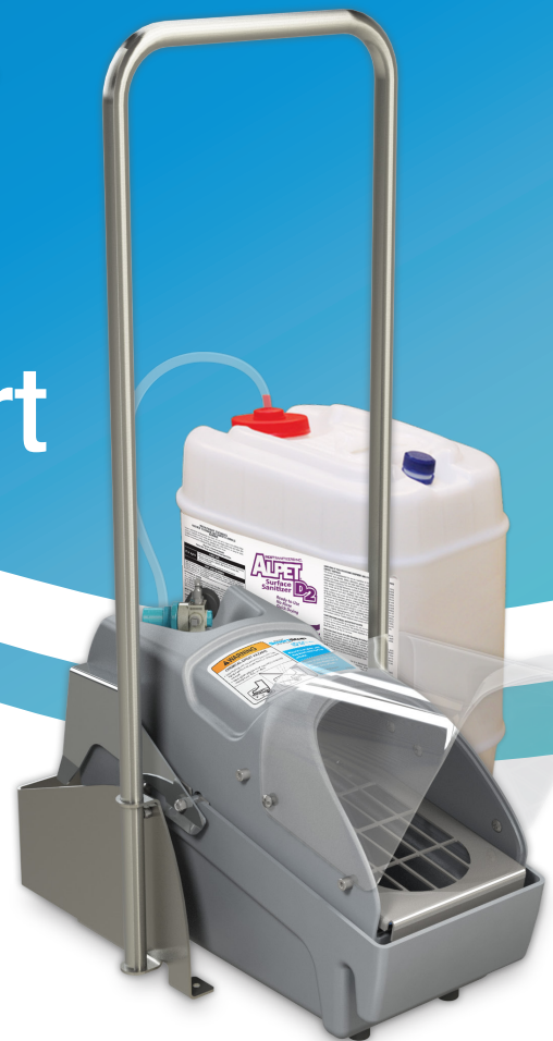
ADB0002-MH SmartStep TM Sanitizing Unit w/ handle

This foot-operated unit uses compressed air to deliver an atomized spray of Alpet® D2 Surface Sanitizer. Each application provides ample coverage to footwear soles while using only 0.2 ounces of chemical, minimizing waste and improving moisture control. A compact, yet powerful tool that supports the safety of food processing facilities by effectively sanitizing footwear at critical control points before employees enter the production floor.