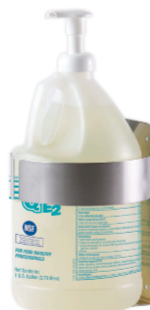
Gallon Wall Bracket MD10200