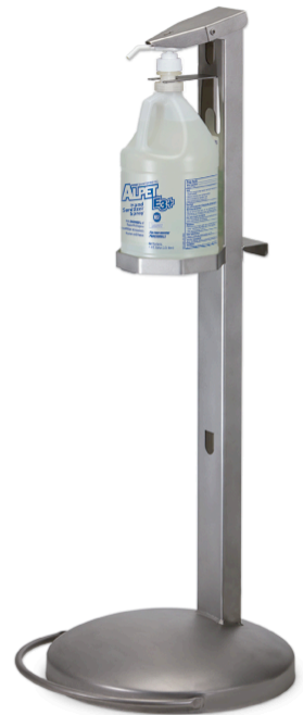
EZ-Step Portable Foot Activated Dispenser MD10012