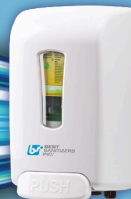
VersaClenz Manual MD10030 (White) MD10030B (Black)