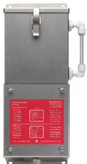
Prizefighter Spray/Soap Dispenser AD10022/AD50002