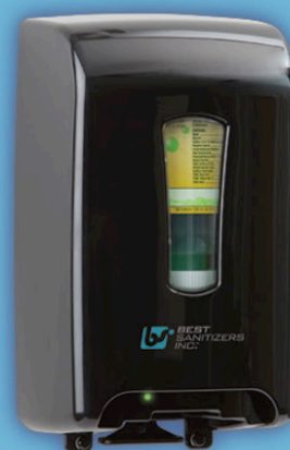
VersaClenz Touchless AD10048B (Black) AD10048 (White)

BrandStand Video KTS1012 w/ Video Display