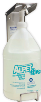
1-2 Knockout Wrist Activated Dispenser MD10003