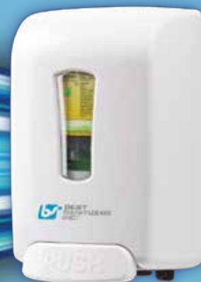
VersaClenz Manual MD10030 (White) MD10030B (Black)