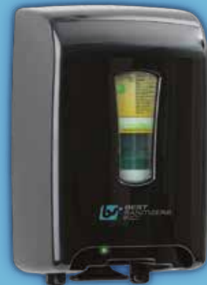
VersaClenz Touchless AD10048B (Black) AD10048 (White)