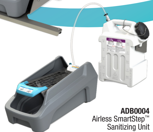
ADB0004 Airless SmartStep™ Sanitizing Unit