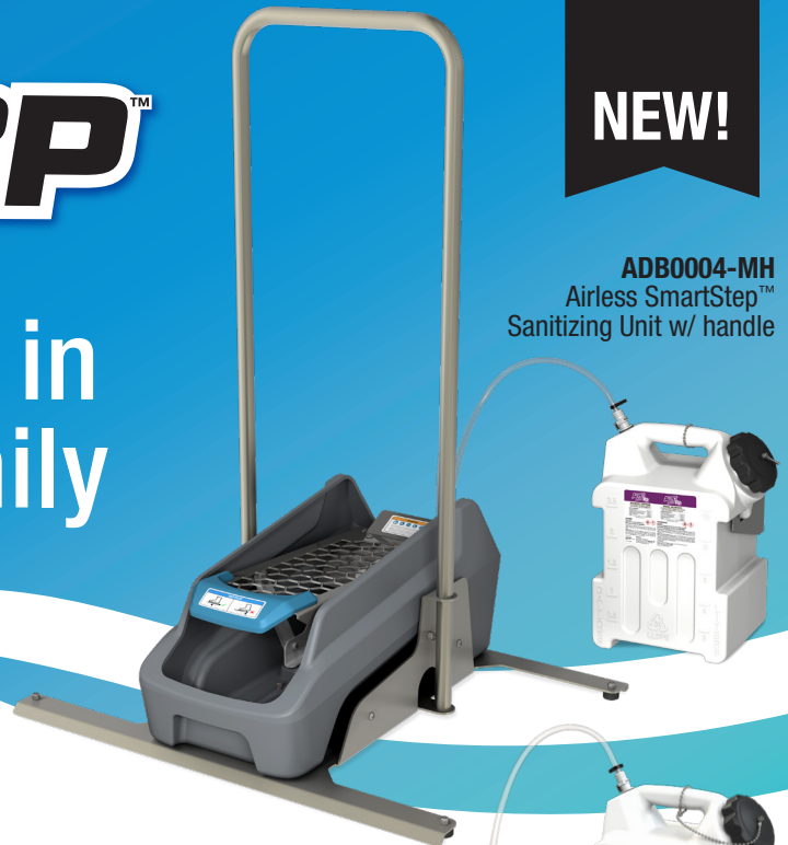
ADB0004-MH Airless SmartStep™ Sanitizing Unit w/ handle