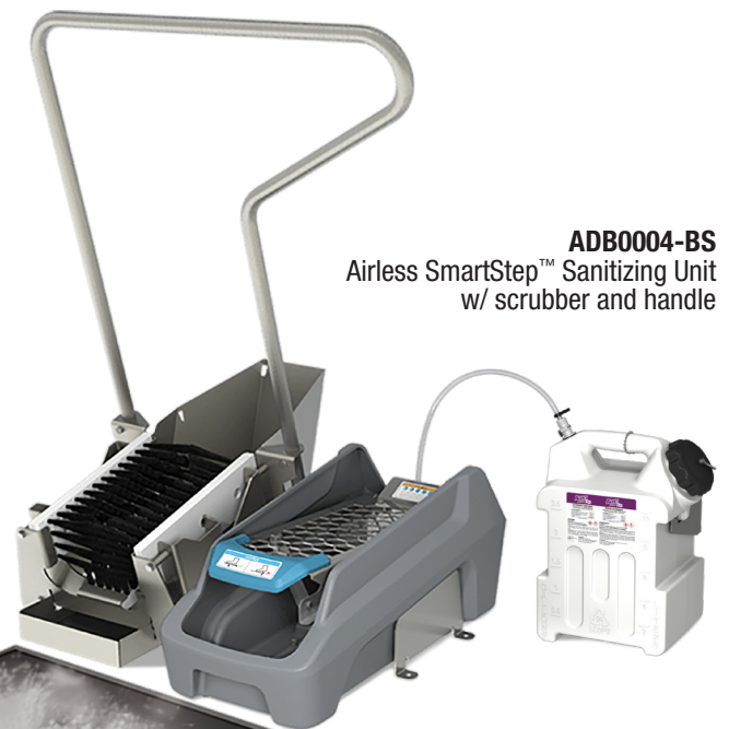
ADB0004-BS Airless SmartStep™ Sanitizing Unit w/ scrubber and handle